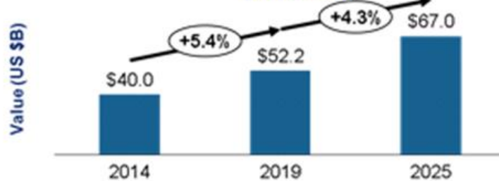
Trends and Forecast for the Global Anti-Aging Market (US $B) (2014-2025)

4.3% between 2020 and 2025, and reach $67 billion by 2025. This market is primarily driven by a growing aging population and increasing awareness about the advantages of using anti-aging products.