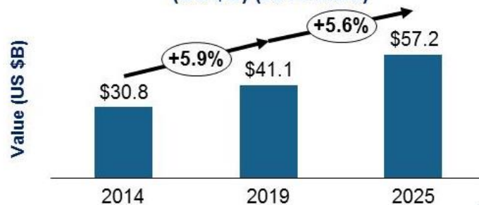
Trends and Forecast for the Global Telecom Cable Market (US $B) (2014-2025)

The telecom cable industry is dynamic and ever-changing. Successful industry players are masters of innovation, change, and adaptation. To retain this status, they need to be attentive to current trends. We believe there will be promising opportunities for telecom cable in the telecommunication infrastructure, CATV, data center, and computer networking markets. As per Lucintel's latest market research report (Source: https://www.lucintel.com/telecom-cable-market.aspx ), the telecom cable market is expected to grow with a CAGR of approx. 5.6% between 2020 and 2025, and reach $57.2 billion by 2025. This market is primarily driven by the increasing demand for internet connectivity, an increasing subscriber base, and growing investment in telecom infrastructure.